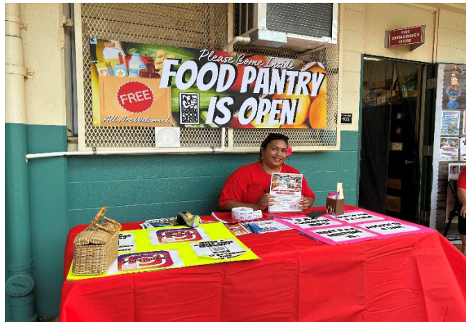
Figure 2 - Blanche Pope Elementary School Open House August 2023 prior to the first day of school. The FRC Director organized the event with food trucks, entertainment, community resources, donation center, and free school supplies.

Return on investment of an FRC to the child welfare system is documented by OMNI Institute 3 and Casey Family Programs Outcome and Cost-Savings Data for Selected Types of Family Support Services – A Summary for Orange County Social Services. 4