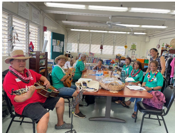
Figure 3 - Waimanalo Elementary and Intermediate School Kupuna Day included the Kupuna Crew and FRC Director (standing left) shown above. Kupuna Day included story time and singalong with the students.